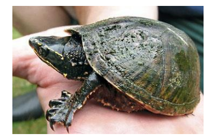
Common Musk Turtle

The Conservation Commission received a request for <u>turtle crossing signs</u> in the Wellington Farms area. In response, ten (10) signs were ordered for locations where turtles are known to cross the road in Springtime when they lay their eggs. Please look out for the Turtle Crossing signs and be kind to the turtles. The inquiry regarding turtles inspired additional research on the subject and found seven (7) species of turtle native to NH: the Snapping, Eastern Box, Wood, Blanding's, Common Musk, Eastern Painted, and Spotted turtles. The Conservation Commission would like to know more about the turtles that inhabit Hampton Falls for a natural resources inventory. When you see turtles, please take photos and send them to the Conservation Commission email address along with a note regarding the location where the photo was taken. This information assist understanding the type and distribution of turtles in Hampton Falls. This could be a great project for all ages, and especially kids.