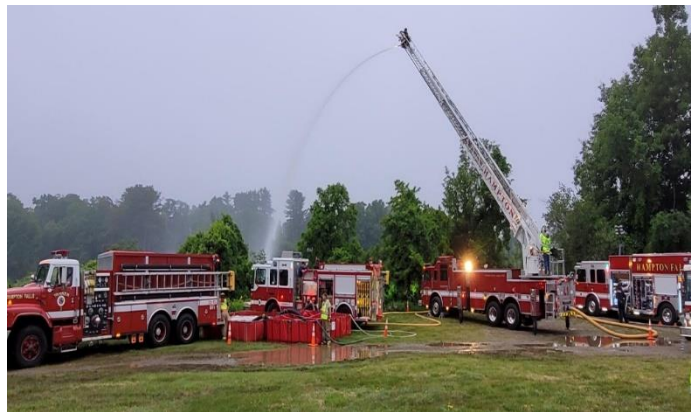
Water shuttle training in July 2023 with HFFD, Hampton, Kensington, East Kingston, S. Hampton, Stratham, Newfields fire departments