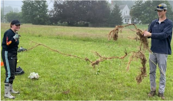
Getting to the root of the problem.

Summer 2023 work with the Interns started with reseeding of burned patches left from Summer 2022 invasive plant removal at the Raspberry Farm, followed by the planting of two (2) tiny Spruce trees. Next, the Summer Interns had a crash course in plant identification, specifically non-native invasive species, followed by field