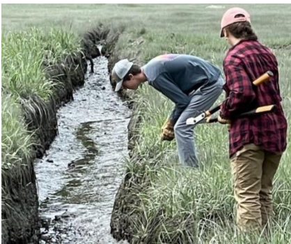
This marsh ditch will be filled with what?

To determine how much fill will be needed (quantity or volume of material) for the salt marsh ditches, the